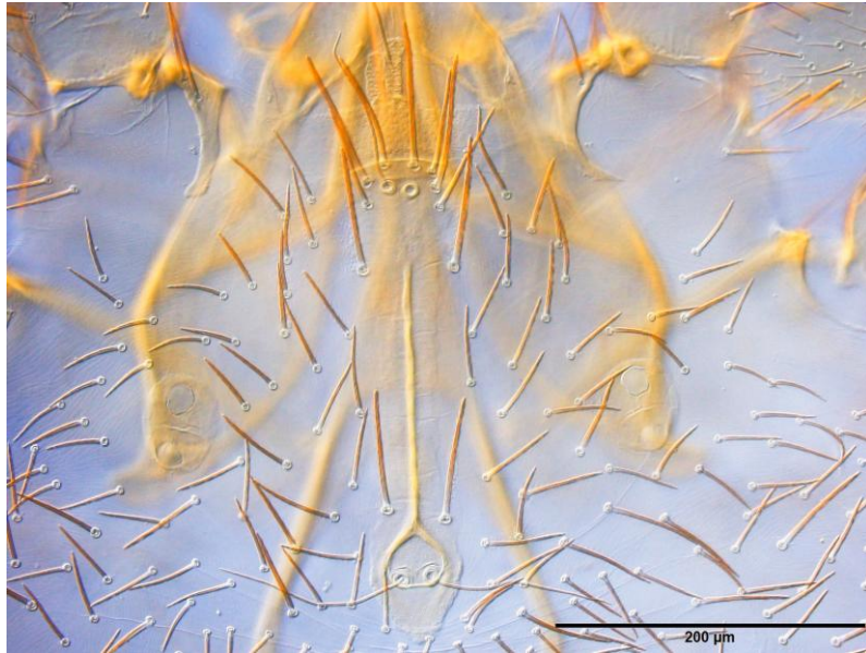
Figure 3.1. Curteria episcopalis , adult, crista metopica and scutum with eye.