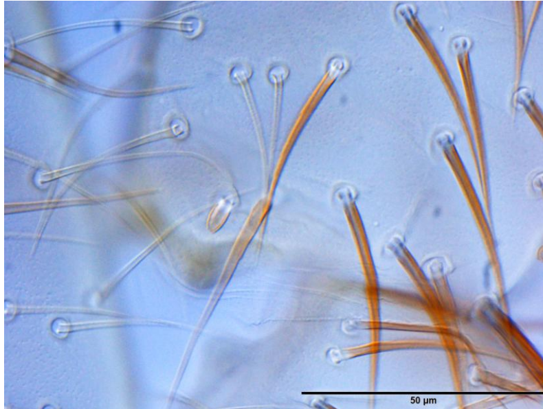
Figure 3.4. Curteria episcopalis , adult, vestigialae of tibia I.

Distribution: Finland, Germany, Poland and the Netherlands (Wohltmann et al., 2007; Mağol and Wohltmann, 2012); Iran (as larva; Keshavarz Jamshidian et al., 2014). New to the Türkiye fauna (Erzincan and Muğla provinces; present study).